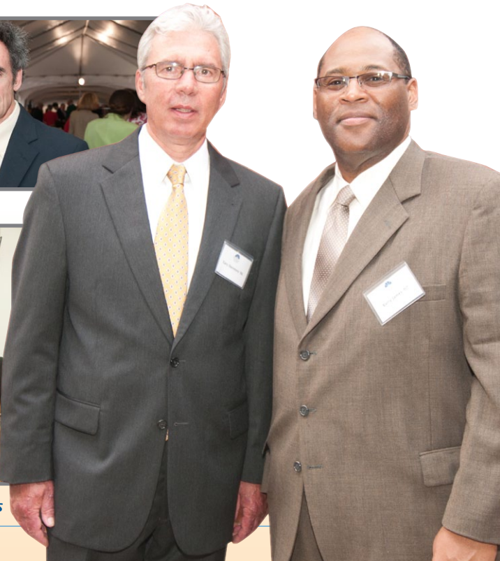
Spring Reception Photos